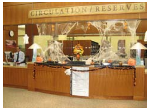
RELATED LINK: Convenant Theological Seminary Library http://www.covenantseminary.edu/ learn/library/

MEMBER FOCUS: Covenant Theological Seminary