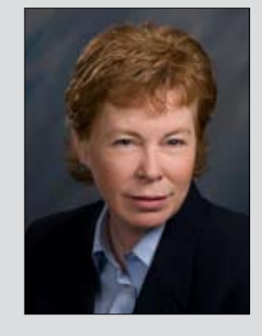
MESSAGE FROM THE MOBIUS EXECUTIVE DIRECTOR:

Welcome to the Fall/Winter edition of News Link, your guide to developments about MOBIUS and the Common Library Platform (CLP) project. The past few months have been exciting for MOBIUS. Inside this issue you'll find a number of interesting articles including features on two of our member institutions: the University of Central Missouri and Covenant Theological Seminary. You'll also find highlights on new technologies to the Consortium Office as well as updates from a few of our committees and on the Consortium Office recent visit to UM Libraries Depository Module 2 (U2).