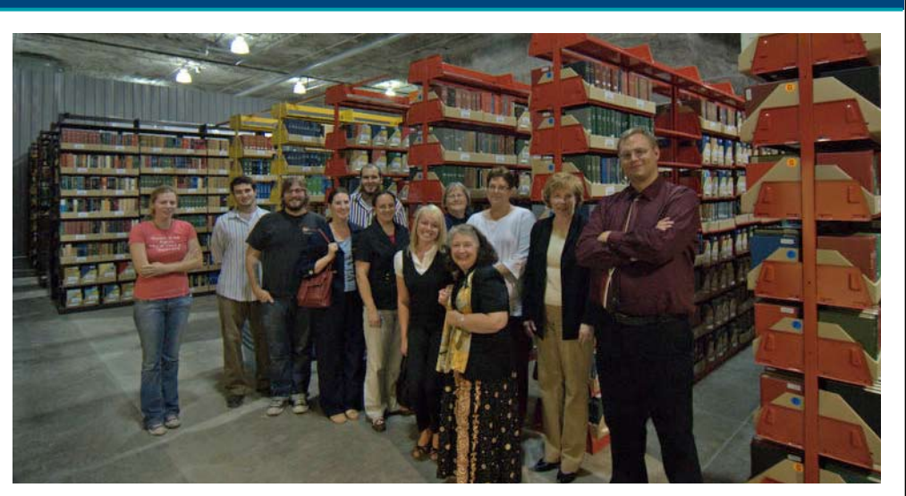
MOBIUS Consortium Office members poses with the University of Missouri Library Depository staff during their recent visit.

"We have chosen to apply many features of a Harvard model depository