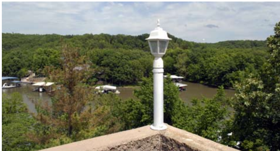
TOP ROW, FROM LEFT: Main Building; Totem Pole.