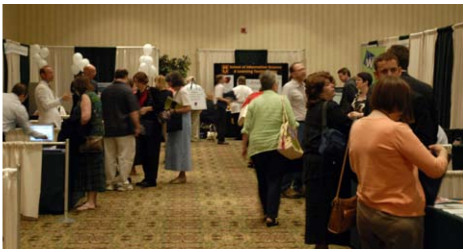
TOP ROW, FROM LEFT: Door Prize Winner; Conference Break.